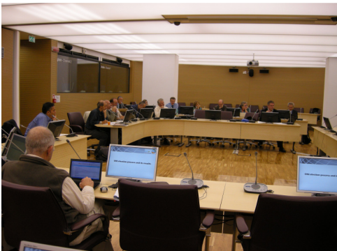
General Assembly of DesertNet International at IFAD in Rome, Italy on 30 September 2010.

Immediately after its transformation into a CSO, DNI started designing the election process for electing the new Steering Committee and Advisory Board. This was the time, when you were invited to consider nominating yourself as a candidate for the election of the new Steering Committee and Advisory Board. We were very happy to receive many nominations from different countries and continents. During the 3-day elections in September (7 to 9 September 2010), 44% of the members of DNI cast their electronic ballots. This was an impressive result, and the election process ended with the inauguration of a very international and multi-disciplinary Steering Committee and Advisory Board at the General Assembly of DNI on 30 September 2010 at IFAD in Rome, Italy. The establishment of the DNI bank account was the final structural measure which was discussed at the General Assembly in Rome. In November 2010, the DNI bank account was opened in France. As members of DNI you received all details about the bank account a few weeks ago in order to pay your annual membership fees.